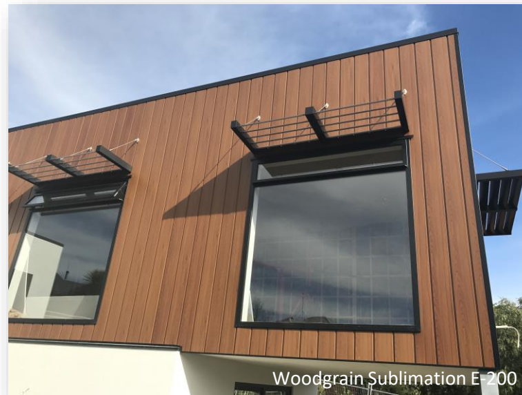
Woodgrain Sublimation E-200

Applying sublimation coatings is a two-stage, labour intensive process so this attracts a cost premium, typically plus $60/m2 over standard powder coated product.