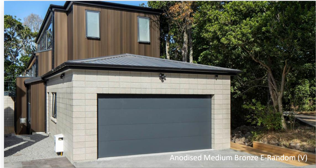
Anodised Medium Bronze E-Random (V)