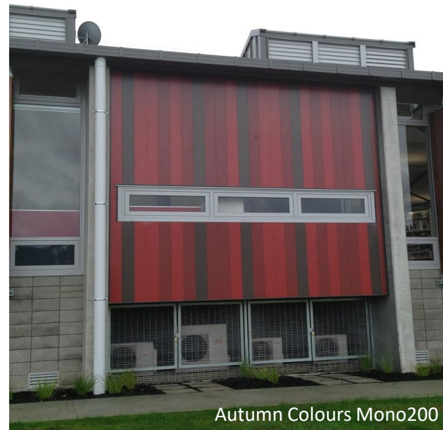
Autumn Colours Mono200