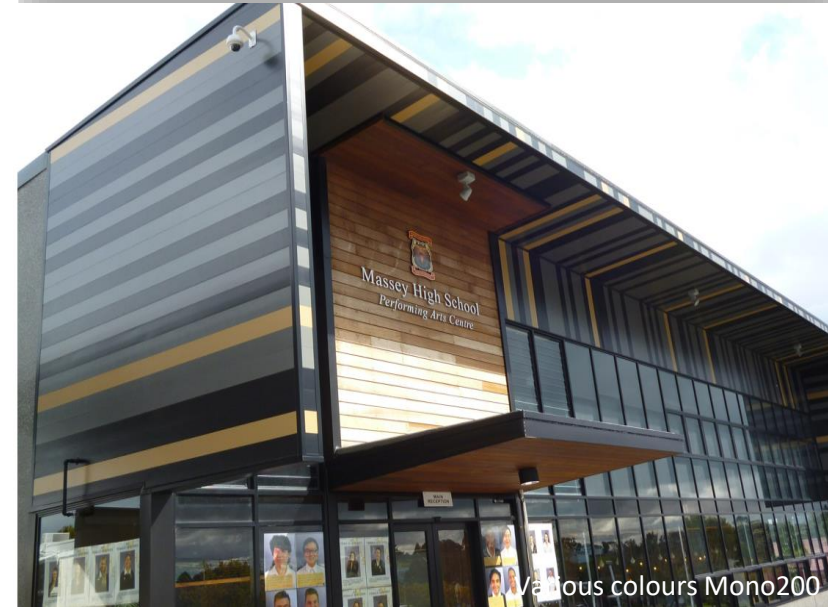
Various colours Mono200