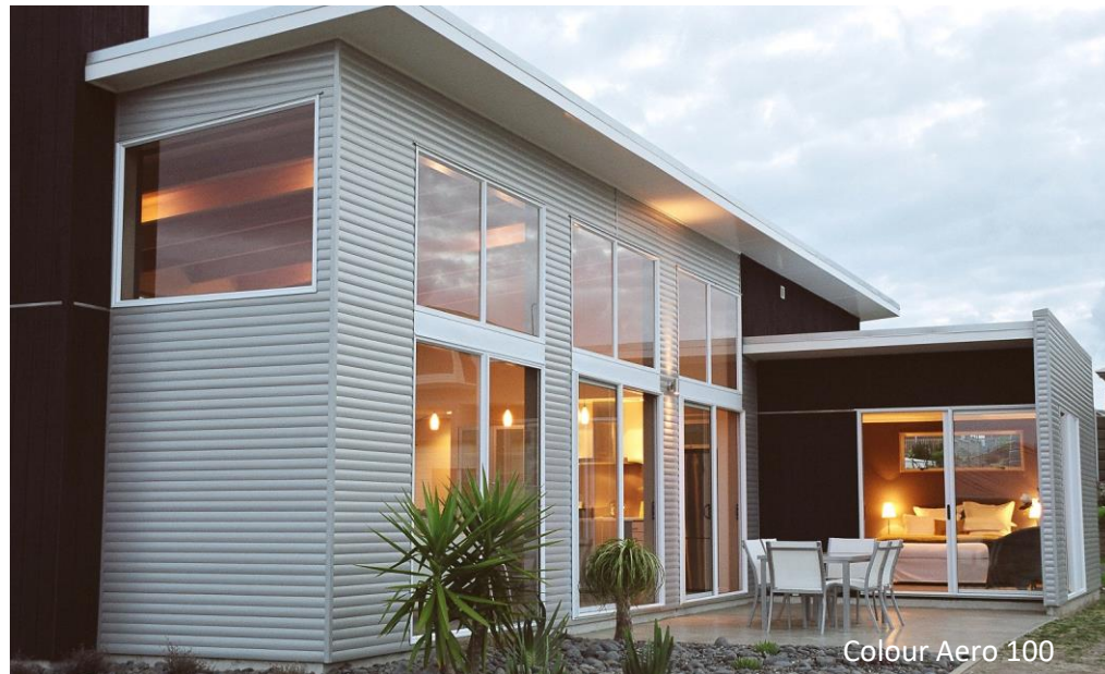
Colour Aero 100