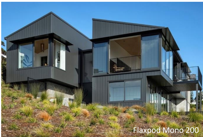
Flaxpod Mono 200