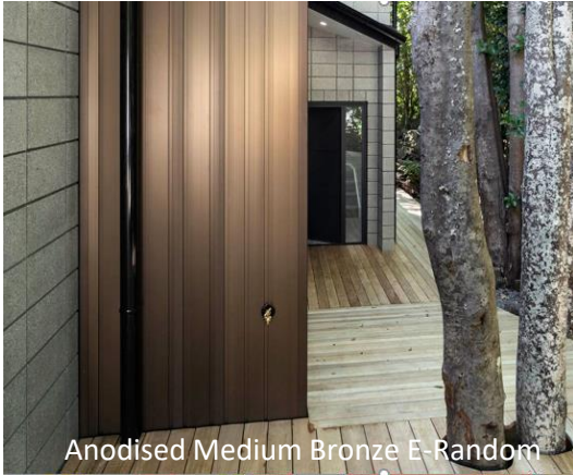
Anodised Medium Bronze E-Random