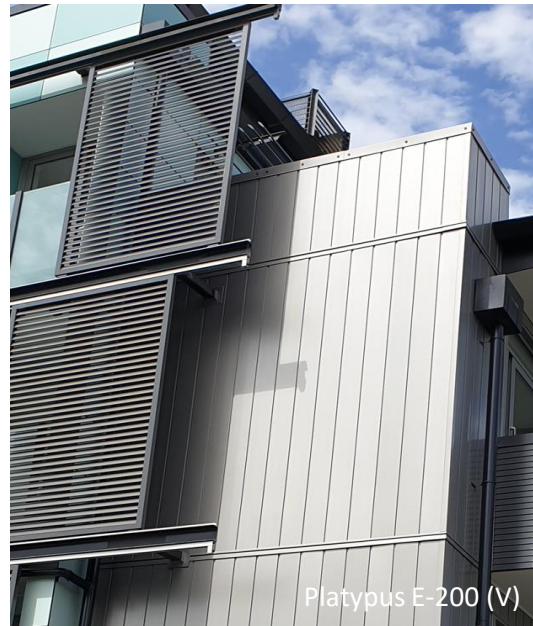
Platypus E-200 (V)