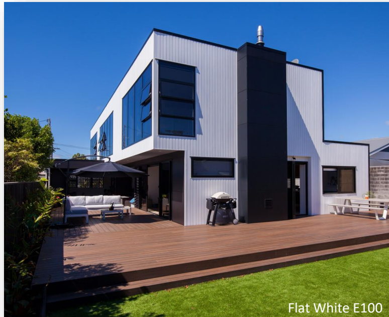
Flat White E100