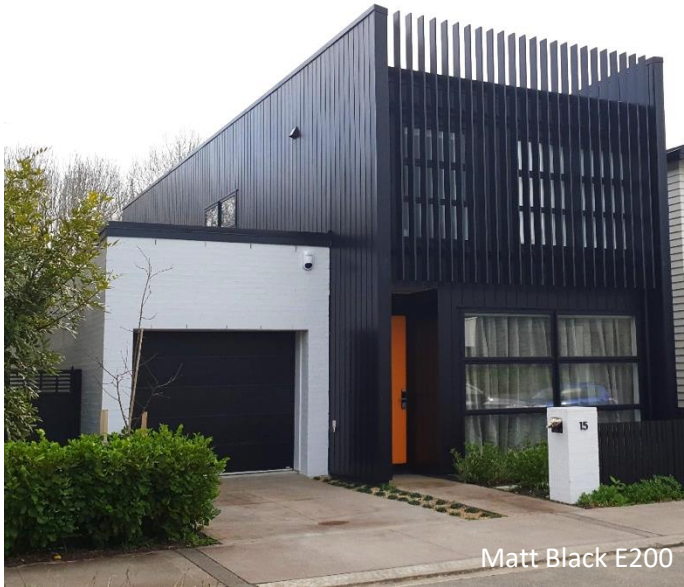
Matt Black E200