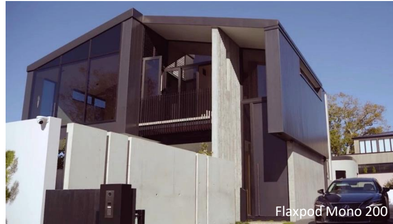
Flaxpod Mono 200