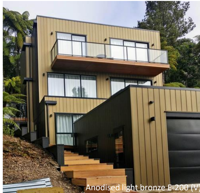
Anodised light bronze E-200 (V)