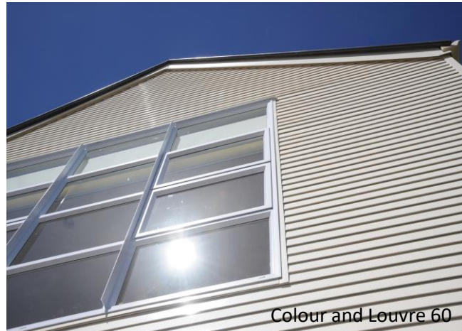
Colour and Louvre 60