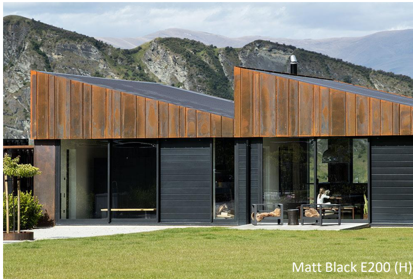
Matt Black E200 (H)