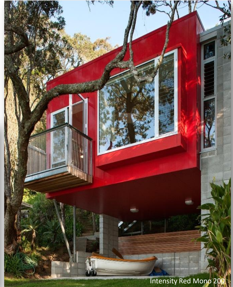
Intensity Red Mono 200