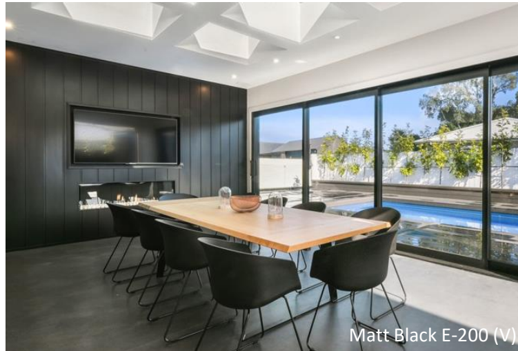
Matt Black E-200 (V)