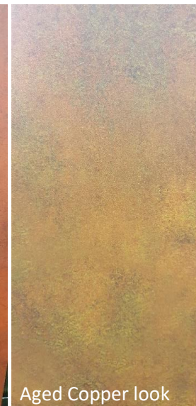
Aged Copper look