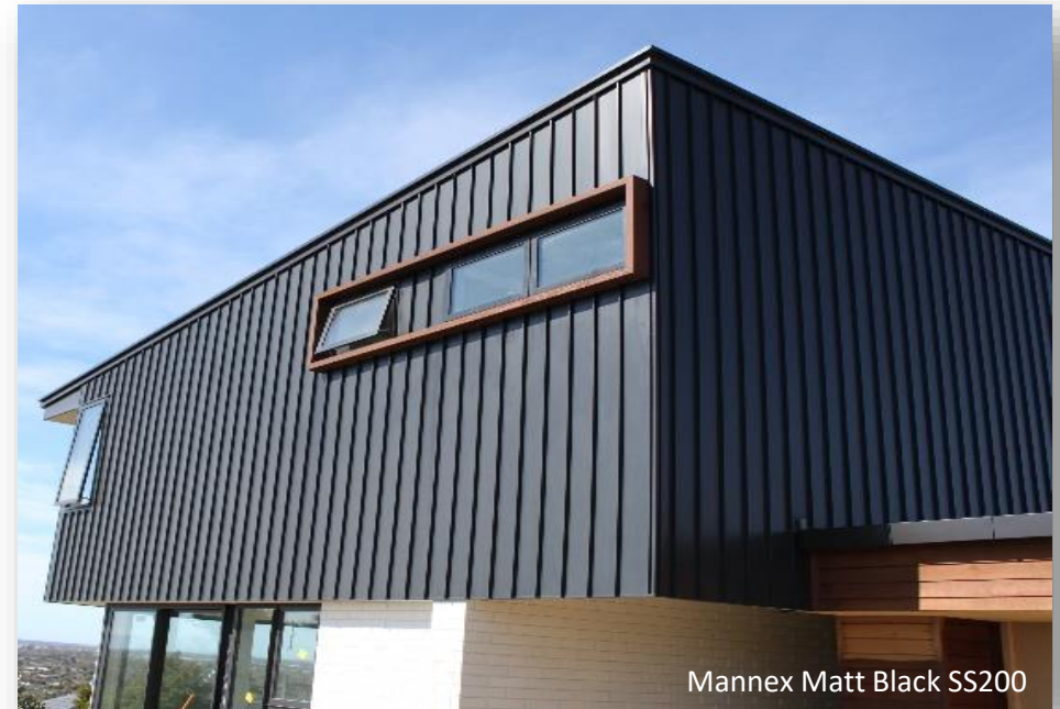
Mannex Matt Black SS200

Very visible finger-printing or suntan lotion stains may occur.