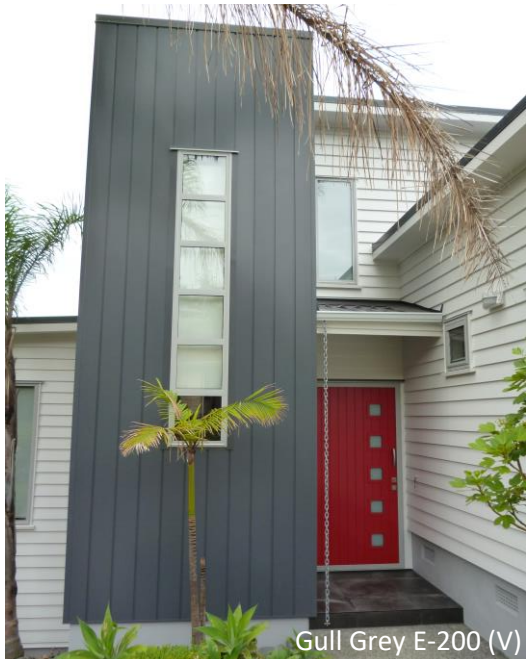
Gull Grey E-200 (V)