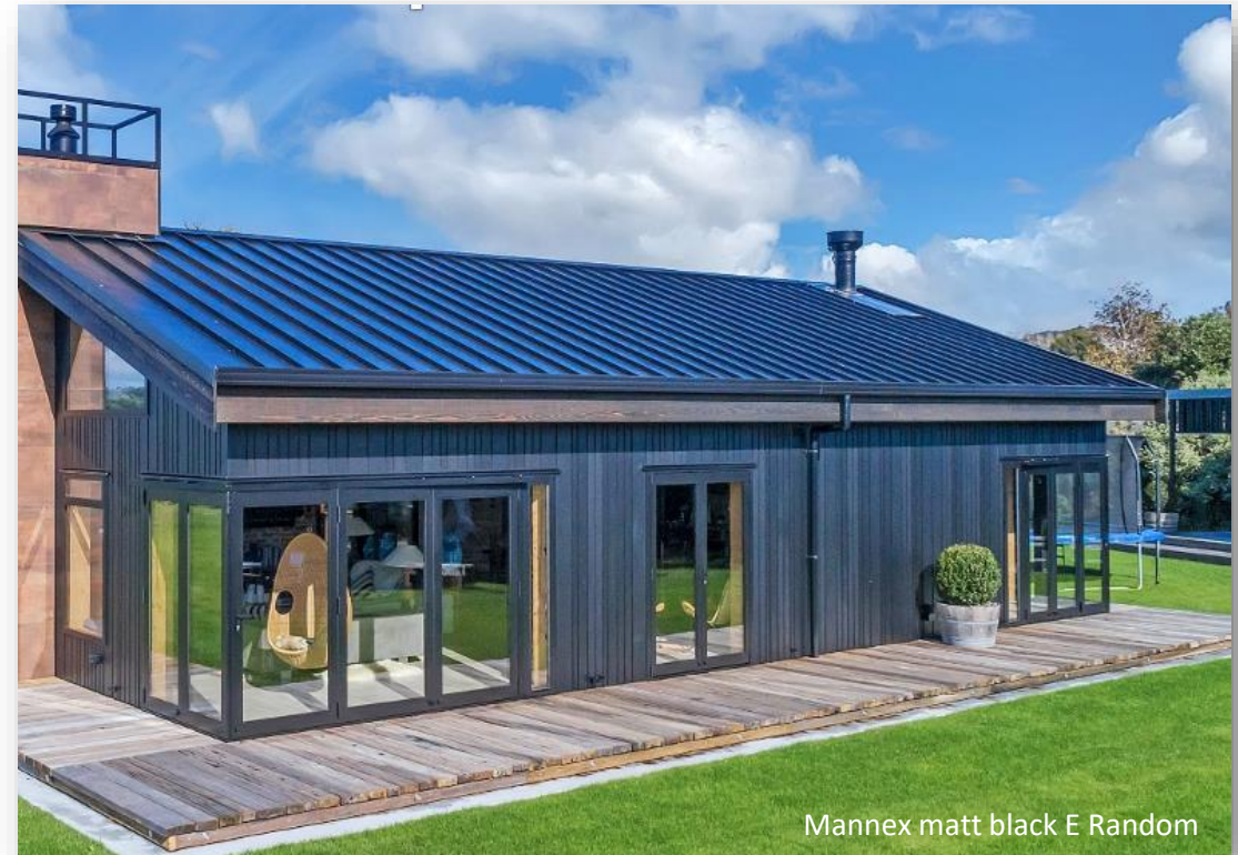
Mannex matt black E Random