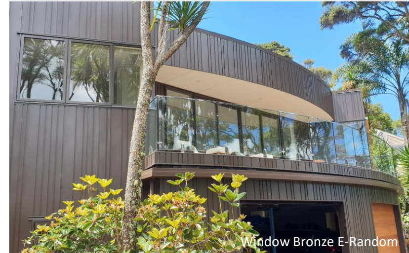
Window Bronze E-Random