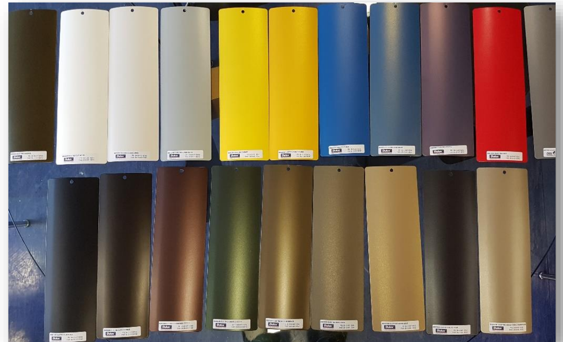
Dulux Electro Colour Range

Nu-Wall can supply MTO textured metallic colours, however there are minimum quantity restraints that apply to the order – See MTO section below