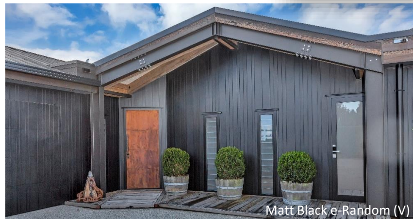
Matt Black e-Random (V)