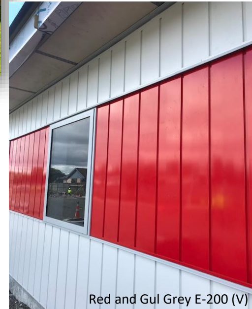
Red and Gul Grey E-200 (V)