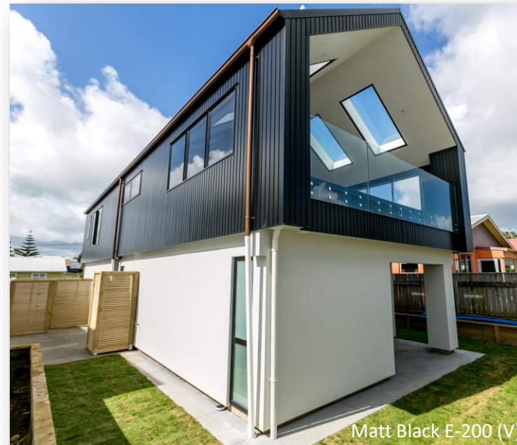
Matt Black E-200 (V)